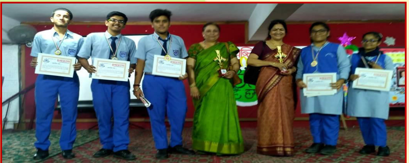
STUDENTS FELICITATED ON HINDI DIWAS (14 TH SEPTEMBER, 2018)