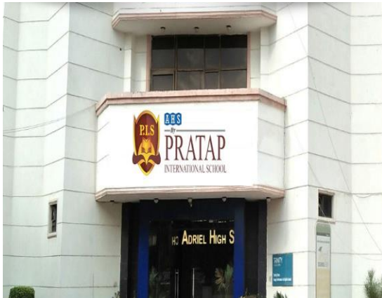
ADRIEL HIGH SCHOOL