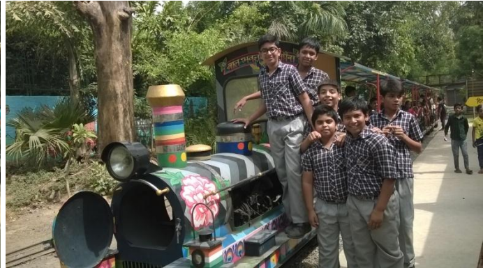
Happy moments-Ride in toy train