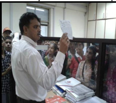
how the system work