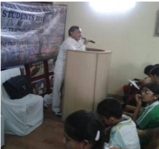
First Aid education