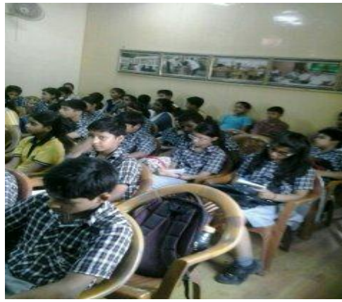
Session on disaster management