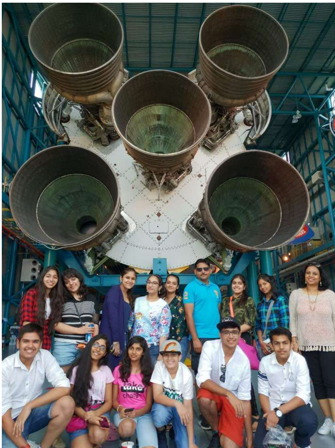
At the Moon Rock Café in Kennedy Space Centre

After a wonderful trip of nine days the group returned home and landed in New Delhi on 20 June. The trip was a great learning experience for all where they made new friends along with acquiring life skills and created memories they would cherish for life.