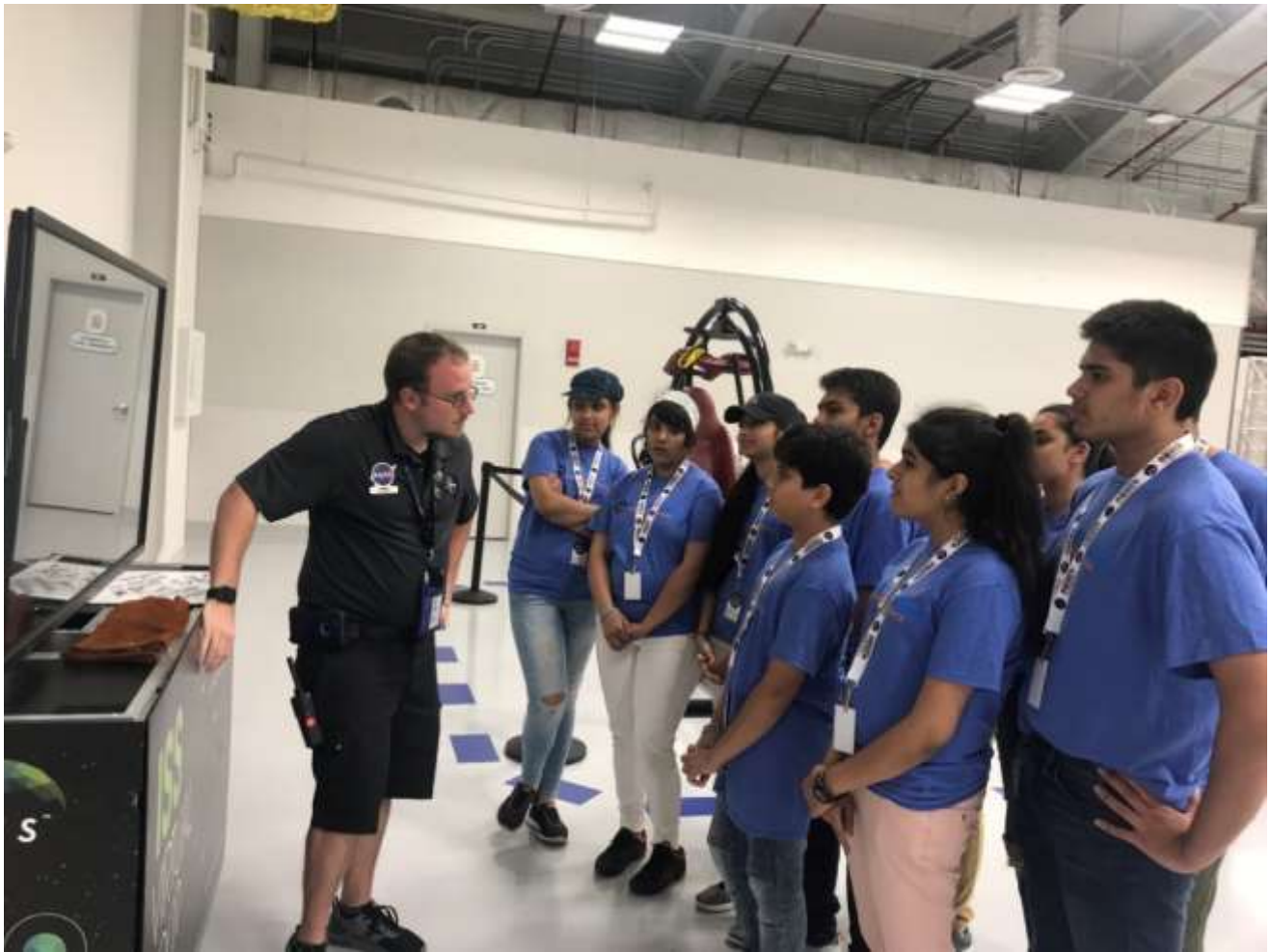
Undergoing the Astronaut Training Experience (ATX) program