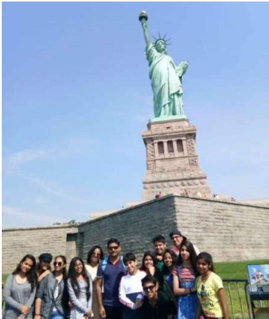
Posing near The Statue of Liberty , New York