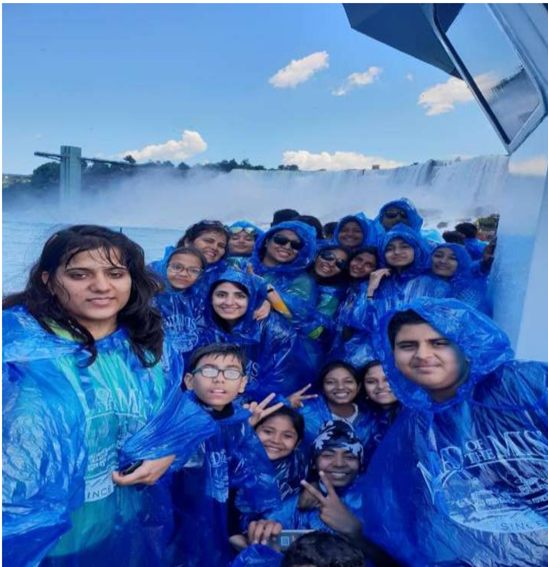
On Board The Maid of The Mist