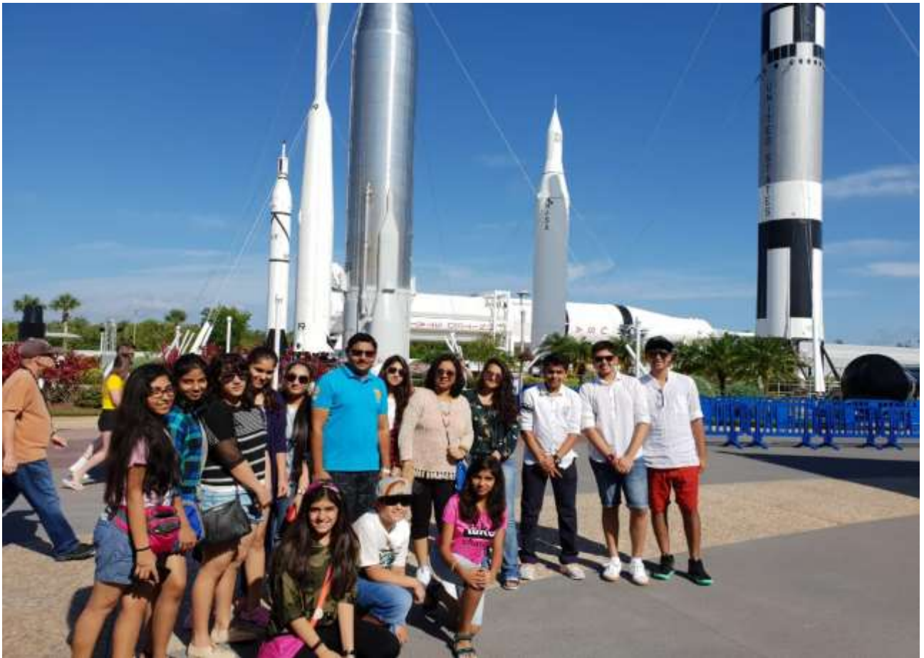
The famous Rocket Garden at Kennedy Space Centre