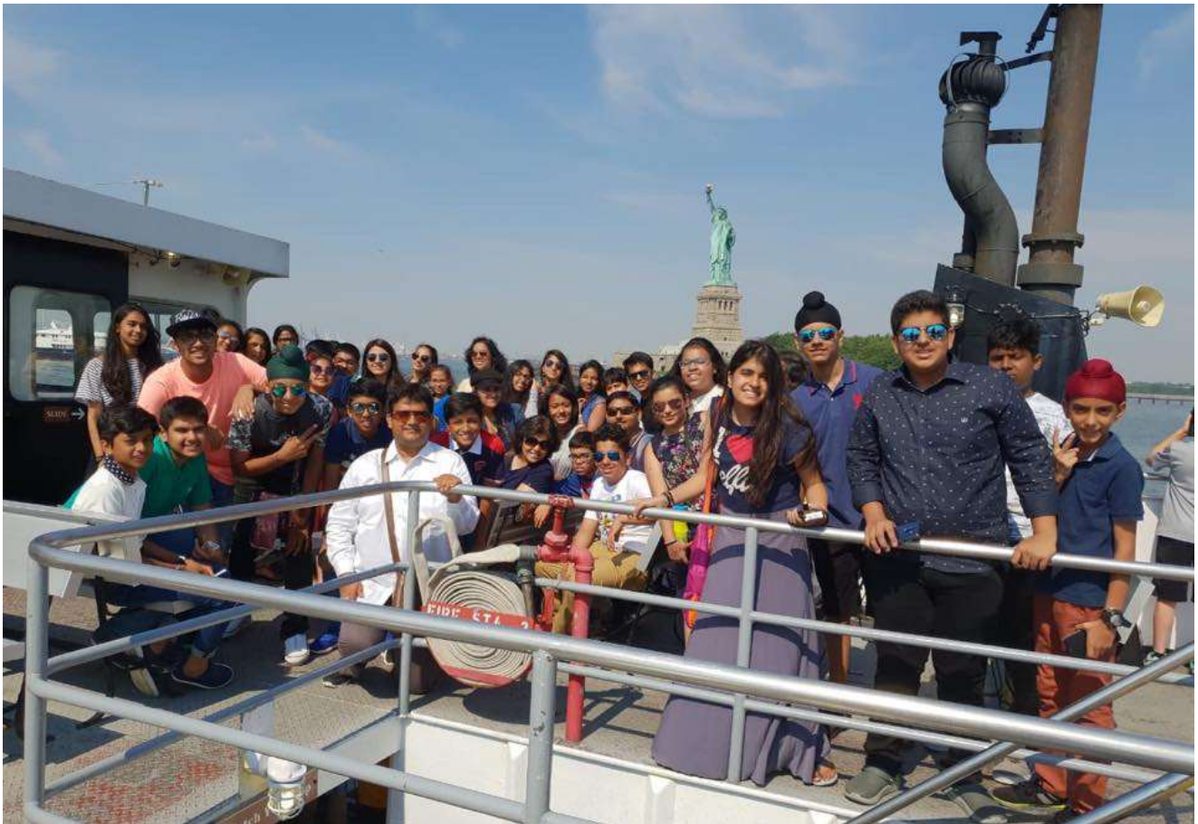
En route the Liberty Island, New York