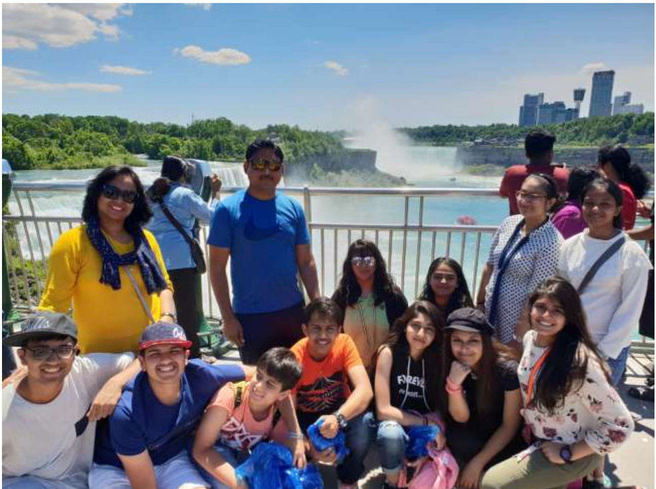
At the majestic Niagara Falls, Buffalo