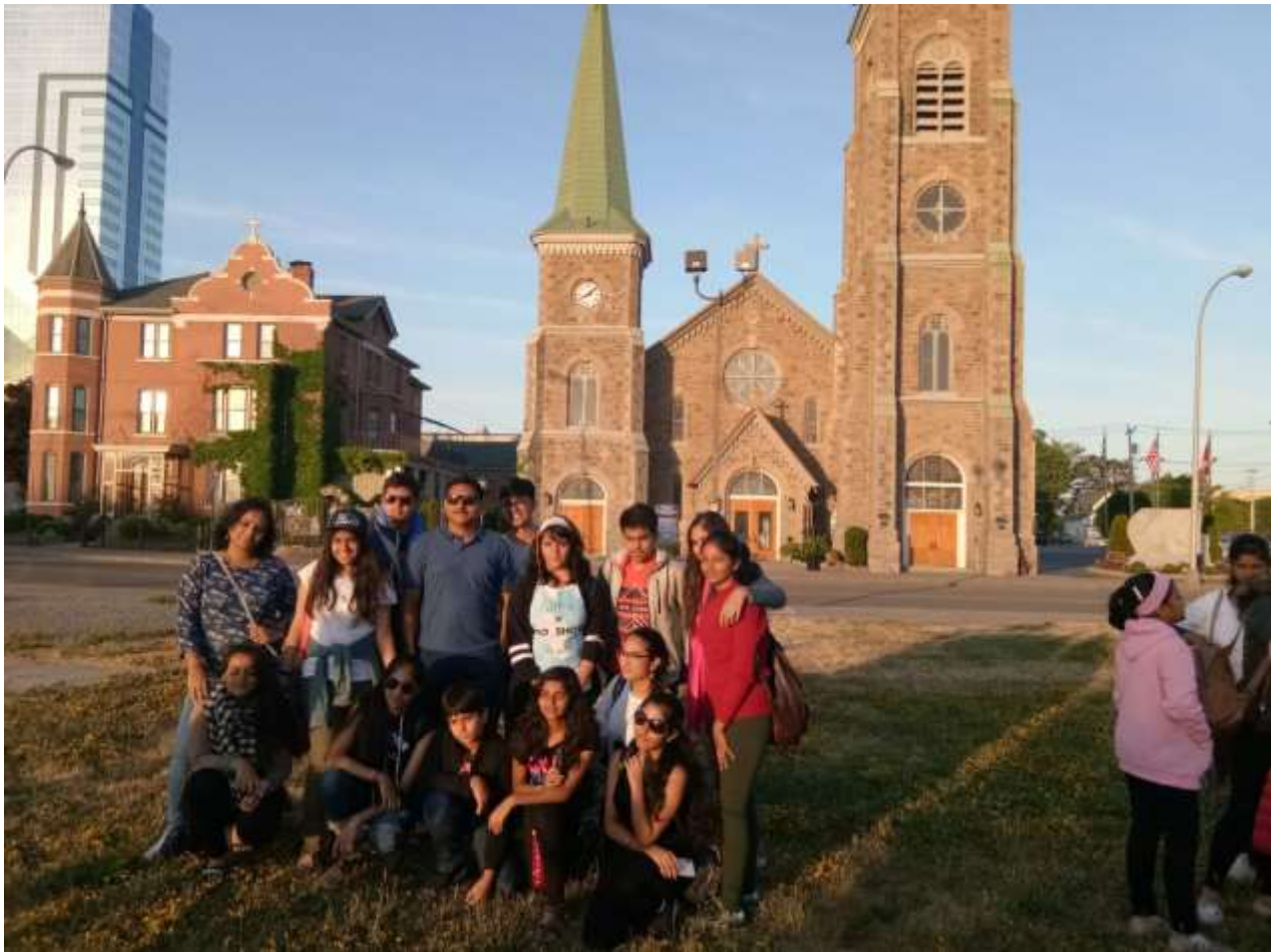
The oldest Church near the Niagara State Falls