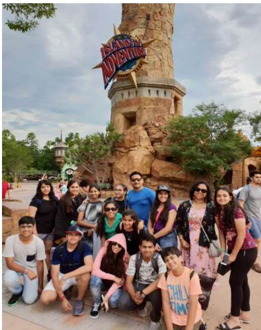
Great fun at The Universal Studios – Island of Adventure, Orlando