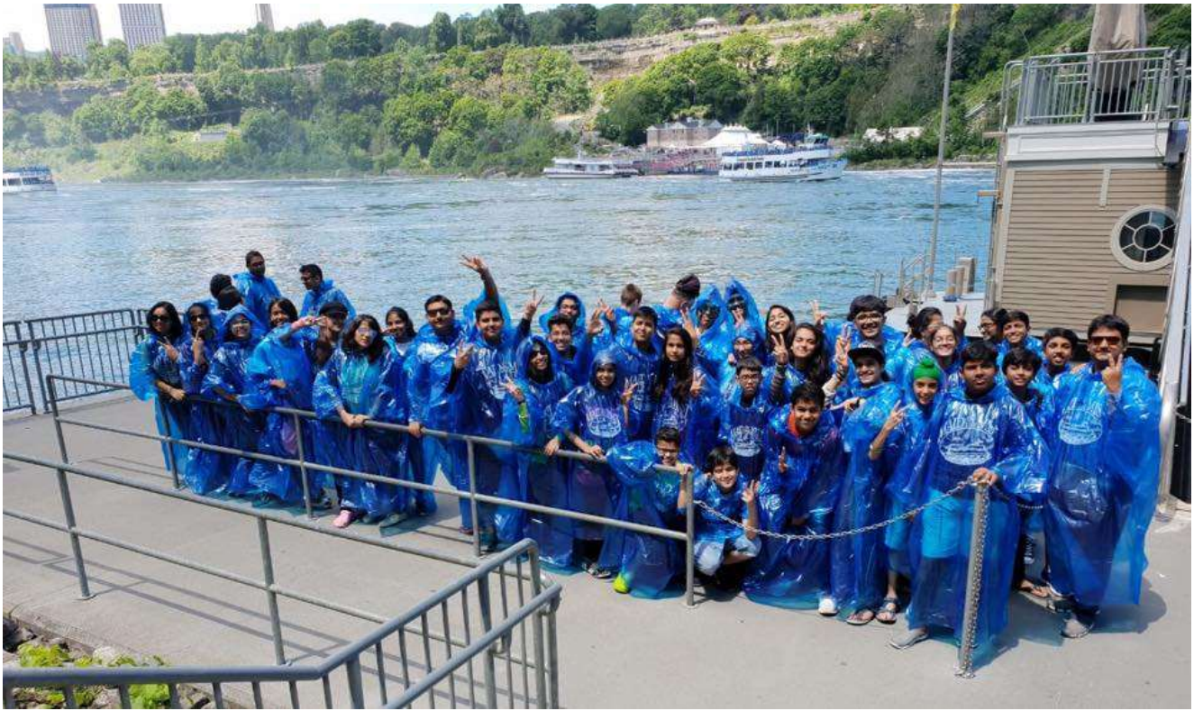
Waiting for The Maid of the Mist boatride