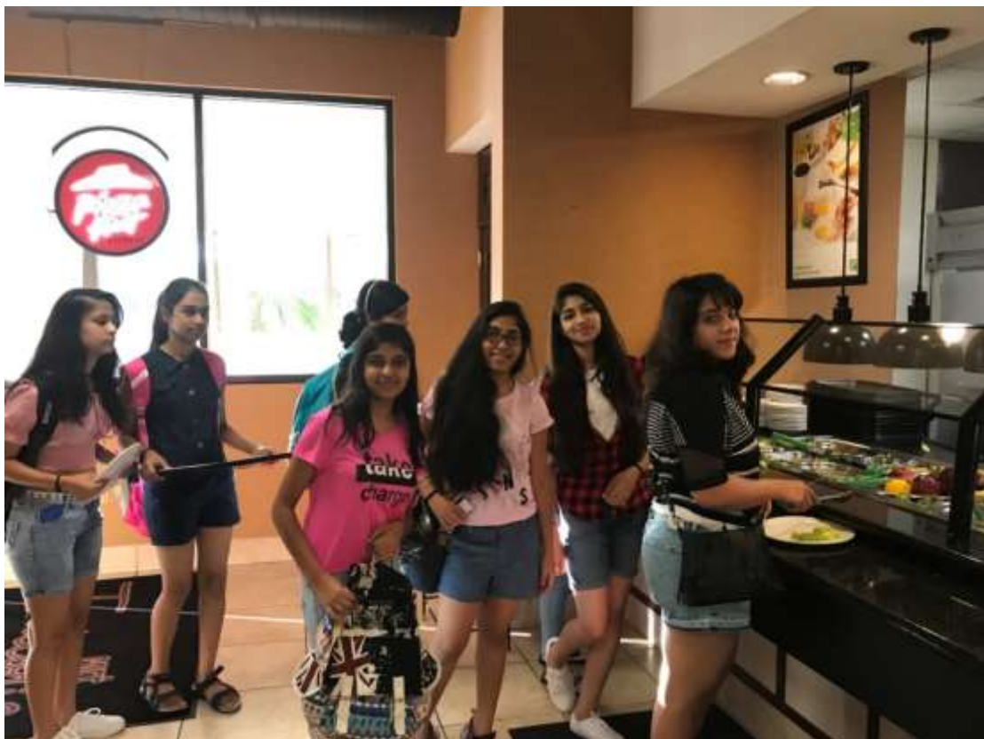
Enjoying the Continental Breakfast at The Holiday Inn, Orland