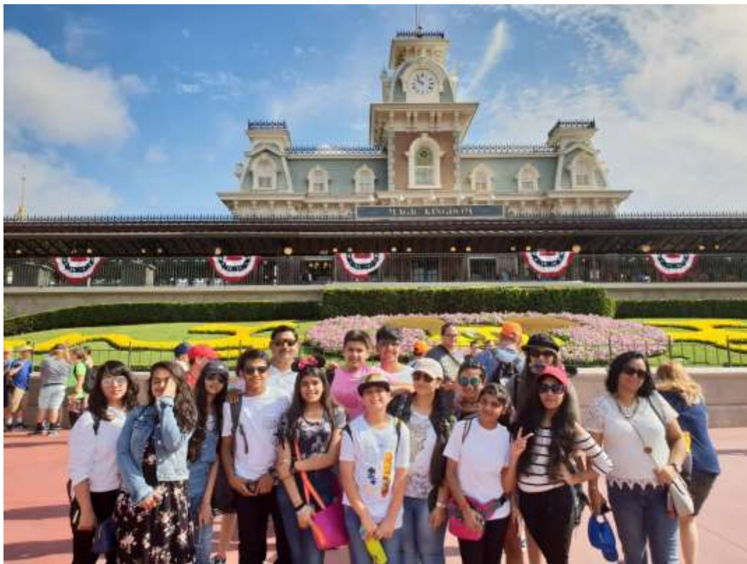
Outside Disneyland at MAGIC KINGDOM, Orlando