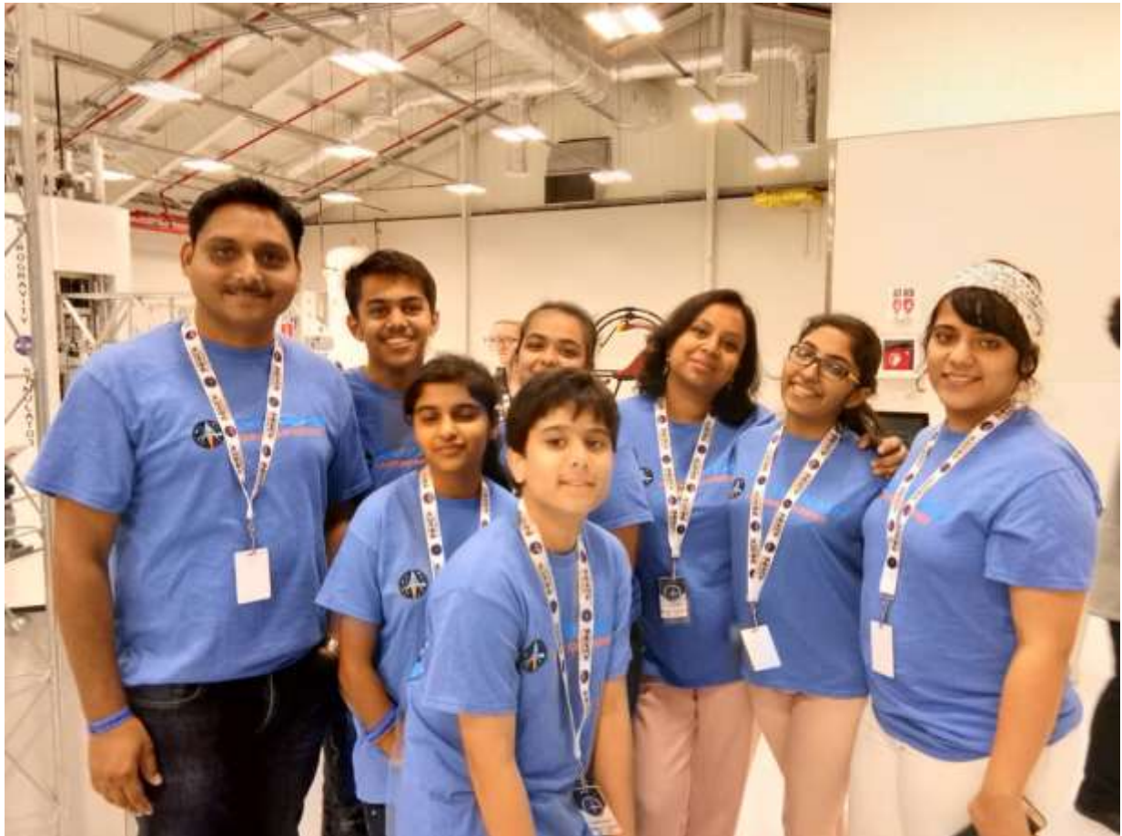
Getting the Hands on experience on being an astronaut at ATX