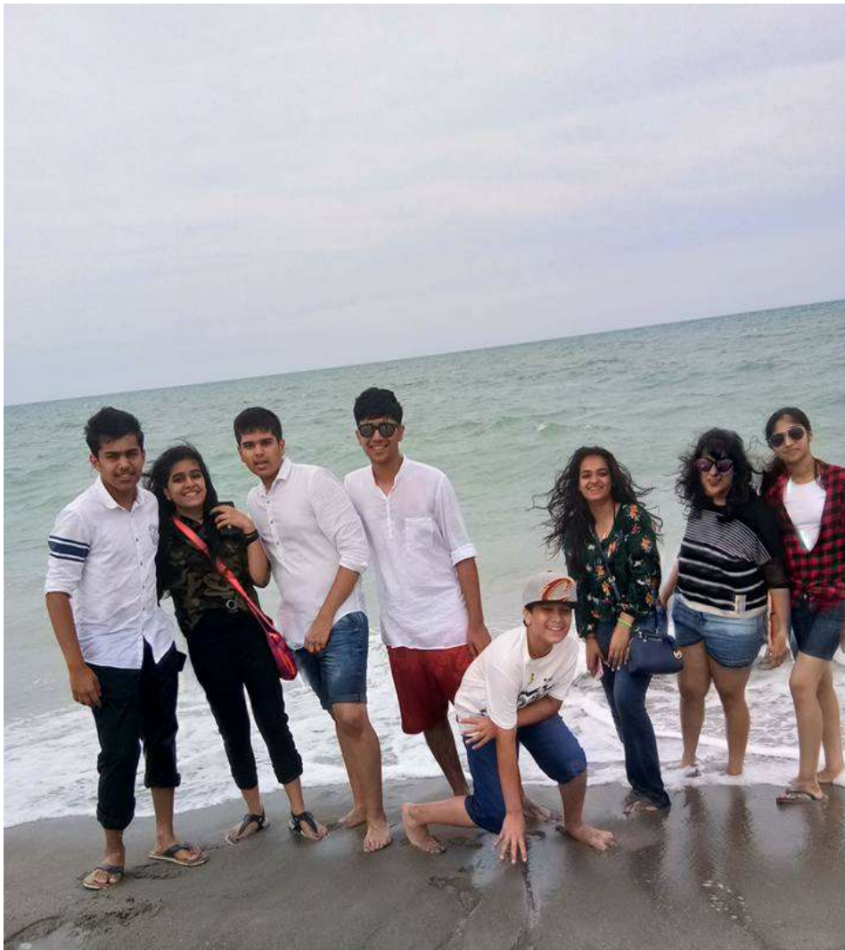
Lovely weather with loads of fun at The Cocoa Beach, Orlando