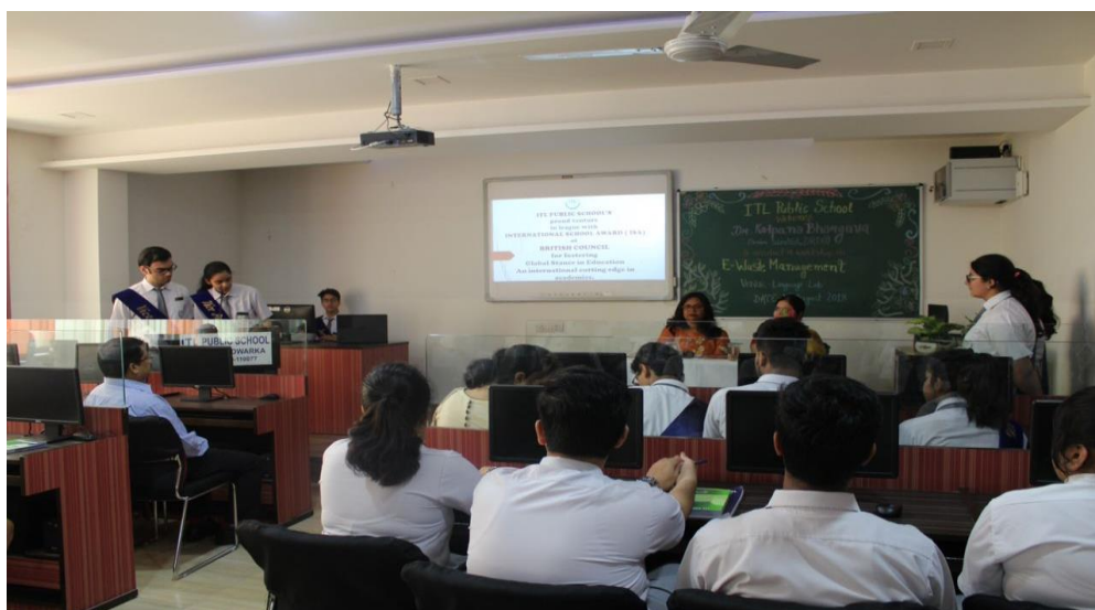
The workshop in progress