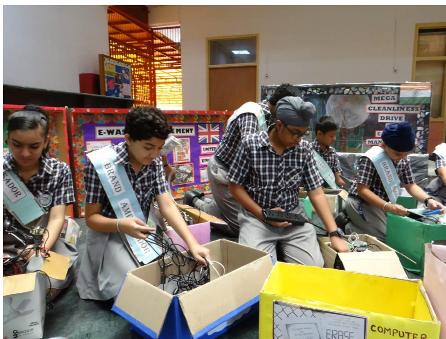
The students of class VIII segregating the E-waste enthusiastically.