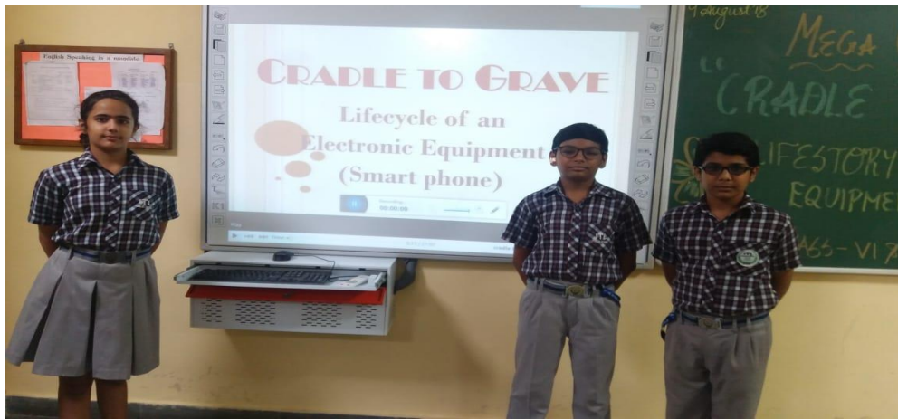
Students show their presentation on 'Lifecycle of a Smart Phone' to their class

7.Sustainable Product Design – Students from classes VI – XI displayed their projects/Models based on sustainable development, which they had designed using parts of discarded electronic equipments. Some of the models that captured attention were Range Detector, Energy from Vehicles, Remote Controlled Floor Cleaner, Hydraulic Arm etc. These activities were a great learning experience for the students. The mega cleanliness drive may have come to an end, but our endeavour to restore the earth to its pristine glory by achieving a harmony between the development and environment will always continue.