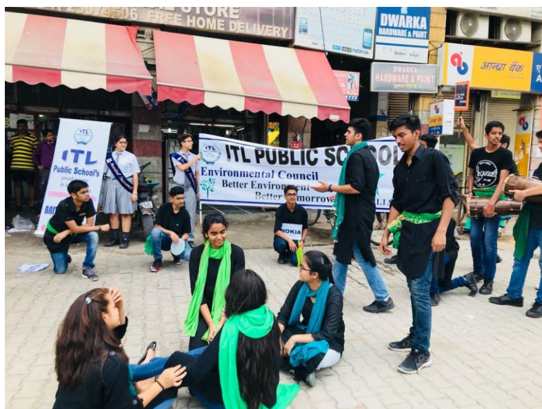
Street play in the market place to generate consciousness about betterment of society.