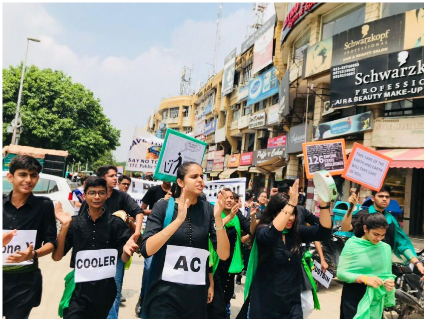
Students strive to create sensitivity by thought provoking slogans.