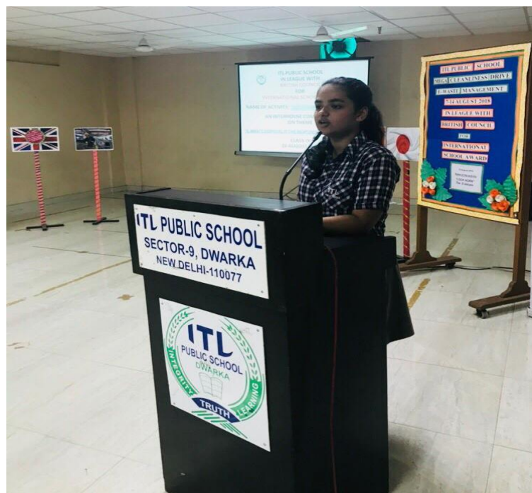
A student puts forth her views during the e – debate.