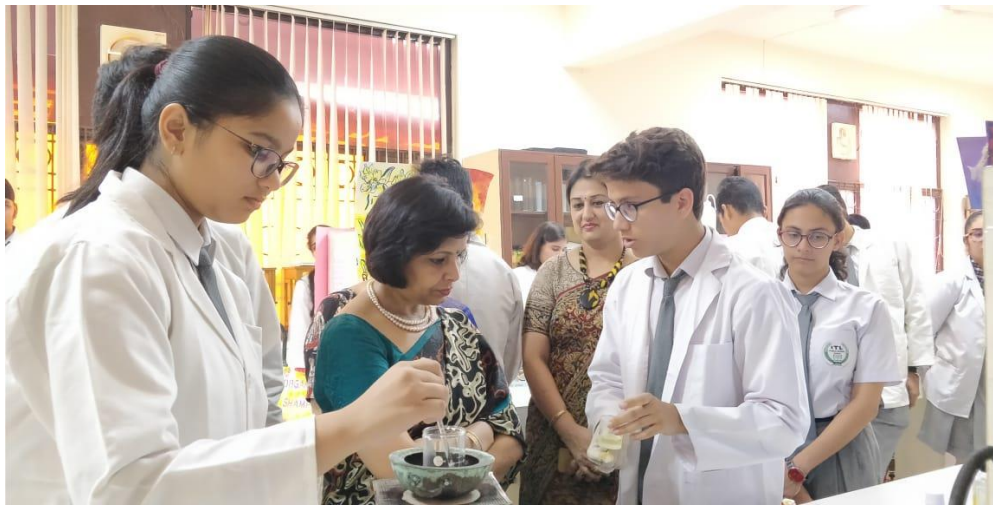
Principal ma'am looks on with interest as students explain the natural ingredients present in their herbal Deostick.