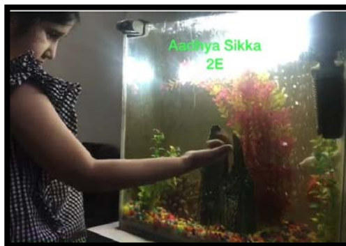
Class I- Paw Print Trivia showcasing their love for the pets at home.