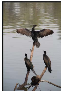
SMRIDHI BHATT A XI-A