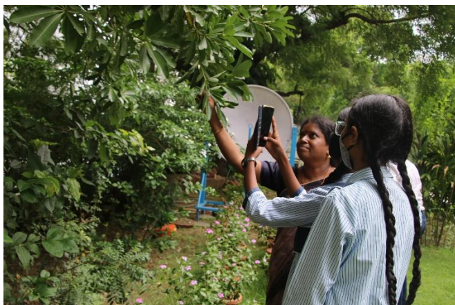
Naming of plants using Google lens