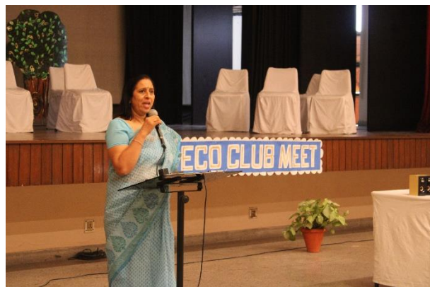
Welcome address by the Principal