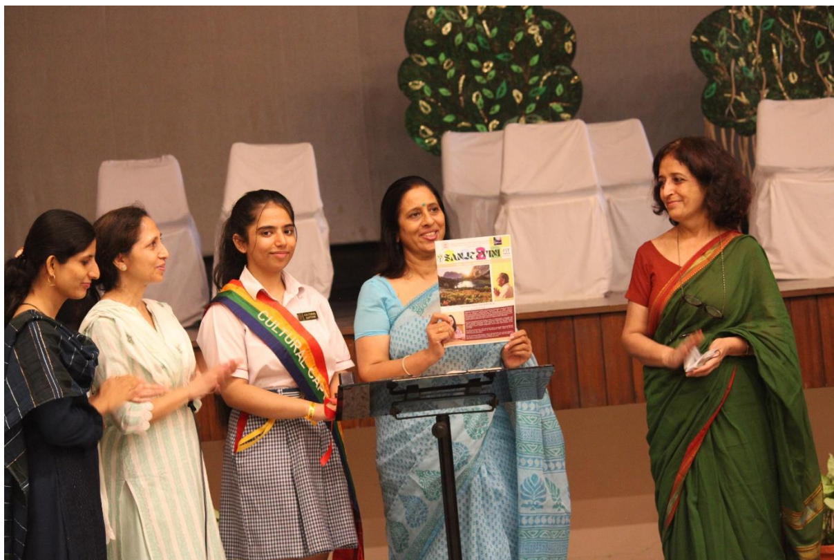
Release of Eco-Club Newsletter