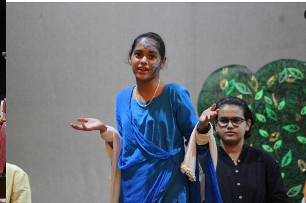
Play on Renewable and Non-renewable energy resources