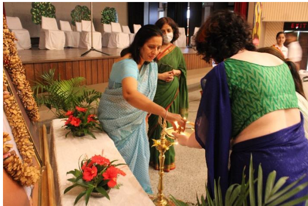
Lighting of the Lamp

The students and teachers participated in all the activities enthusiastically and vowed to pursue environment-friendly practices in their schools and society, so as to forge a sustainable future.