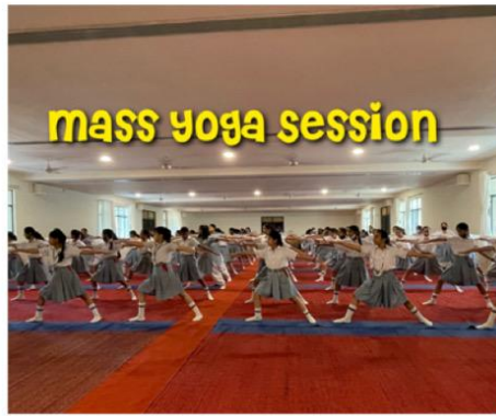
mass yoga session