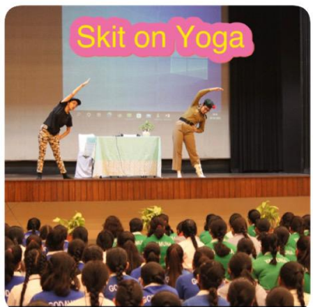
Skit on Yoga