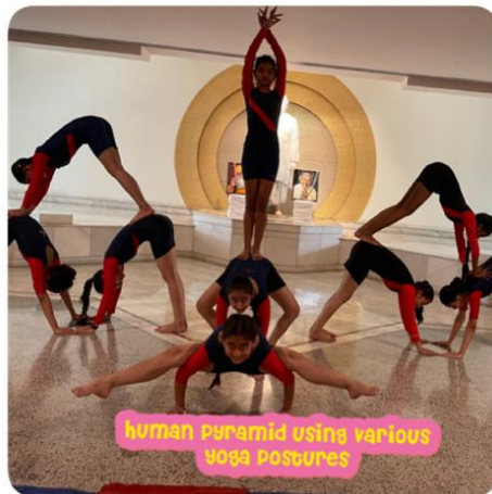
human pyramid using various yoga postures