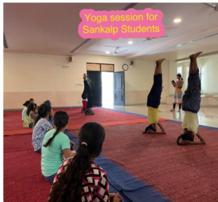
Yoga session for Sankalp Students