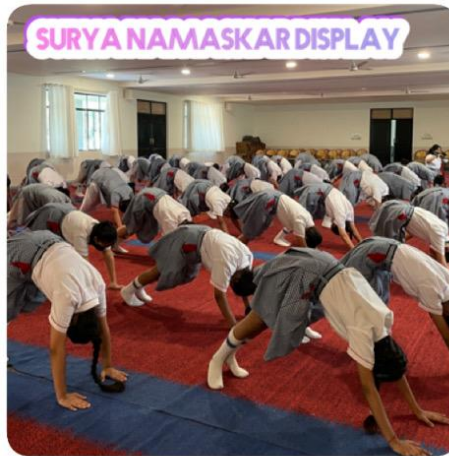
SURYA NAMASKAR DISPLAY