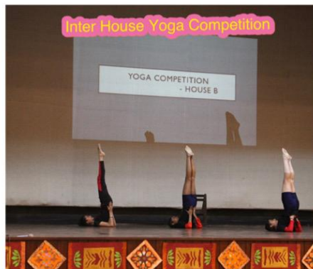
Inter House Yoga Competition