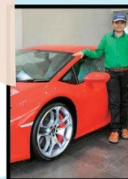
RIDE IN A LAMBORGHINI:

https://makeawishindia.org/wp-content/uploads/2022/04/Wish-Impact-Stories-Book-19.pdf