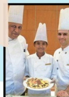
DAY AS A PASTRY CHEF:

https://makeawishindia.org/wp-content/uploads/2022/04/Wish-Impact-Stories-Book-22.pdf