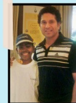
A HERO MEETS A SUPERSTAR:

https://makeawishindia.org/wp-content/uploads/2022/04/Wish-Impact-Stories-Book-9.pdf