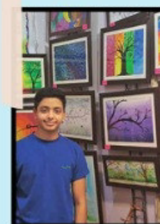
AN ARTIST PAINTS HIS DREAMSCAPE:

https://makeawishindia.org/wp-content/uploads/2022/04/Wish-Impact-Stories-Book-22.pdf