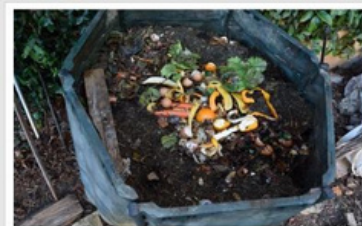
Observation - |

Collect some dead leaves, dried flowers and vegetables waste from your house. Take a pot and put these things in it. Then, put two layers of soil. Add some water in this pot once 3-4 days. After a month, the things will rot to produce a smelly material called compost. This can be added to the soil in the pots with plants or in your home garden. Adding compost to the soil is good for plants. Click the picture of the compost and write your observation in MS Word as shown.