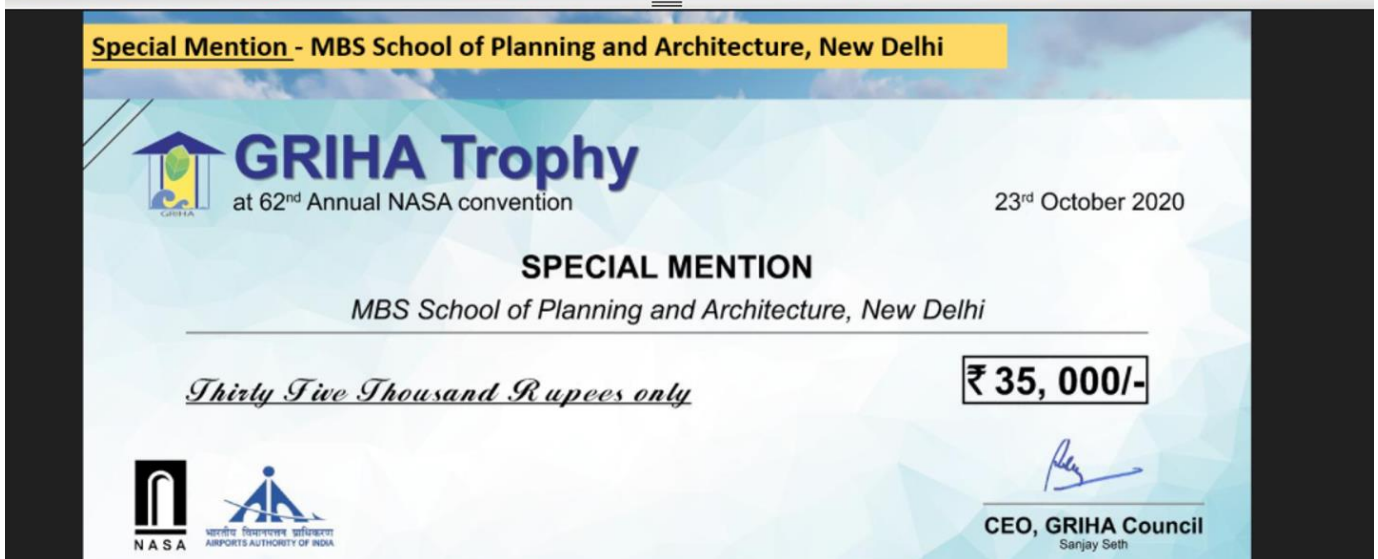
MBS School of Planning and Architecture Special Mention-I Award Certificate.