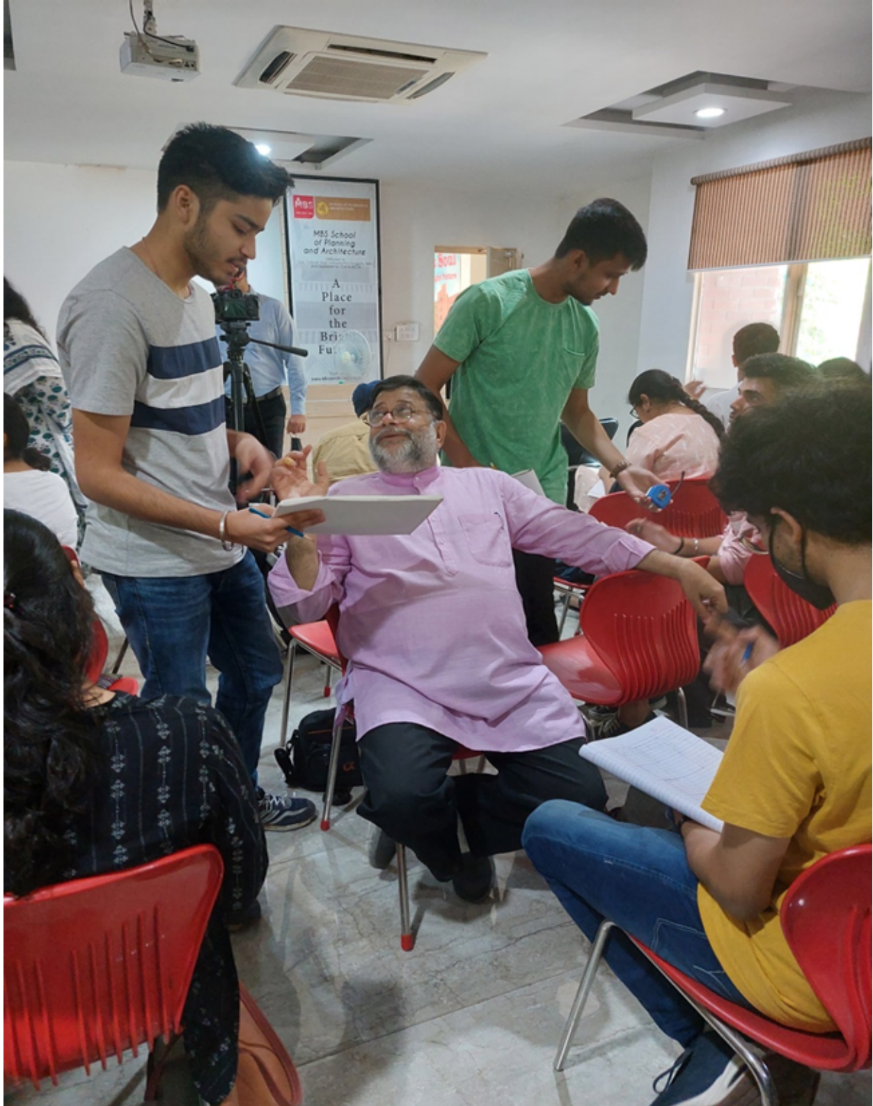
Discussion on the design by one of the student