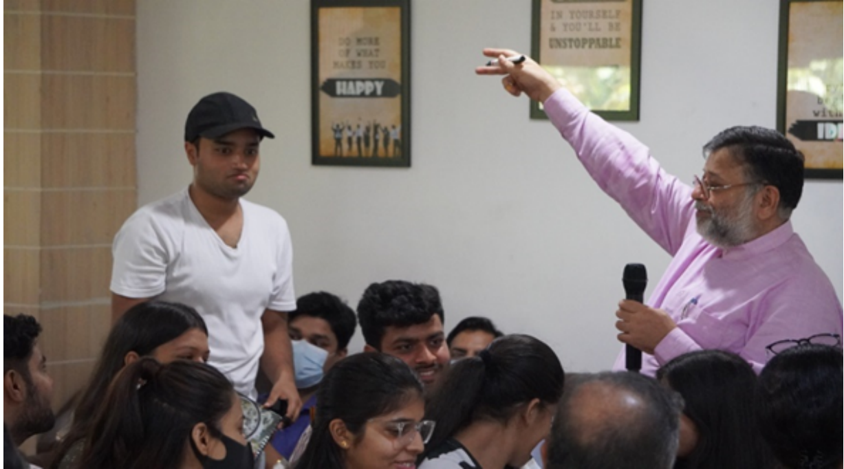
Discussion with the student