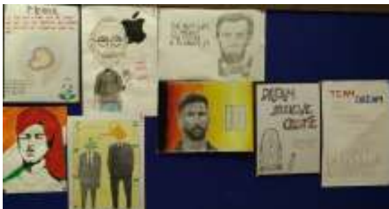
Final selected posters

Certificates were made for all the winners.