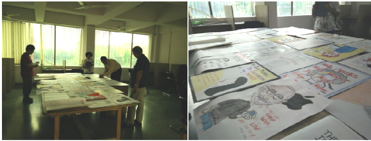
Judgment for the posters