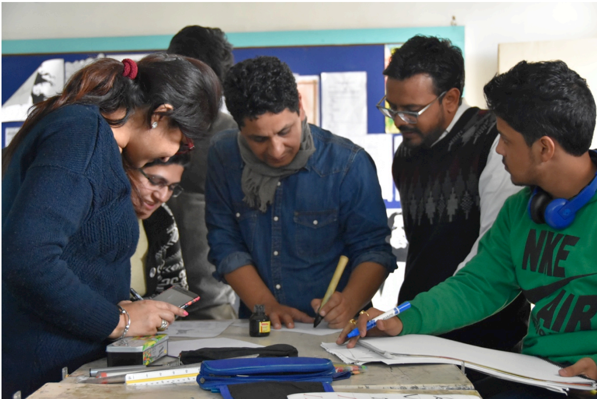
Faculties with the Resource Person.

Overall the whole session was quite interactive wherein both students and few faculties participated actively in all the exercises given to them. Hence it was a great learning experience for all.