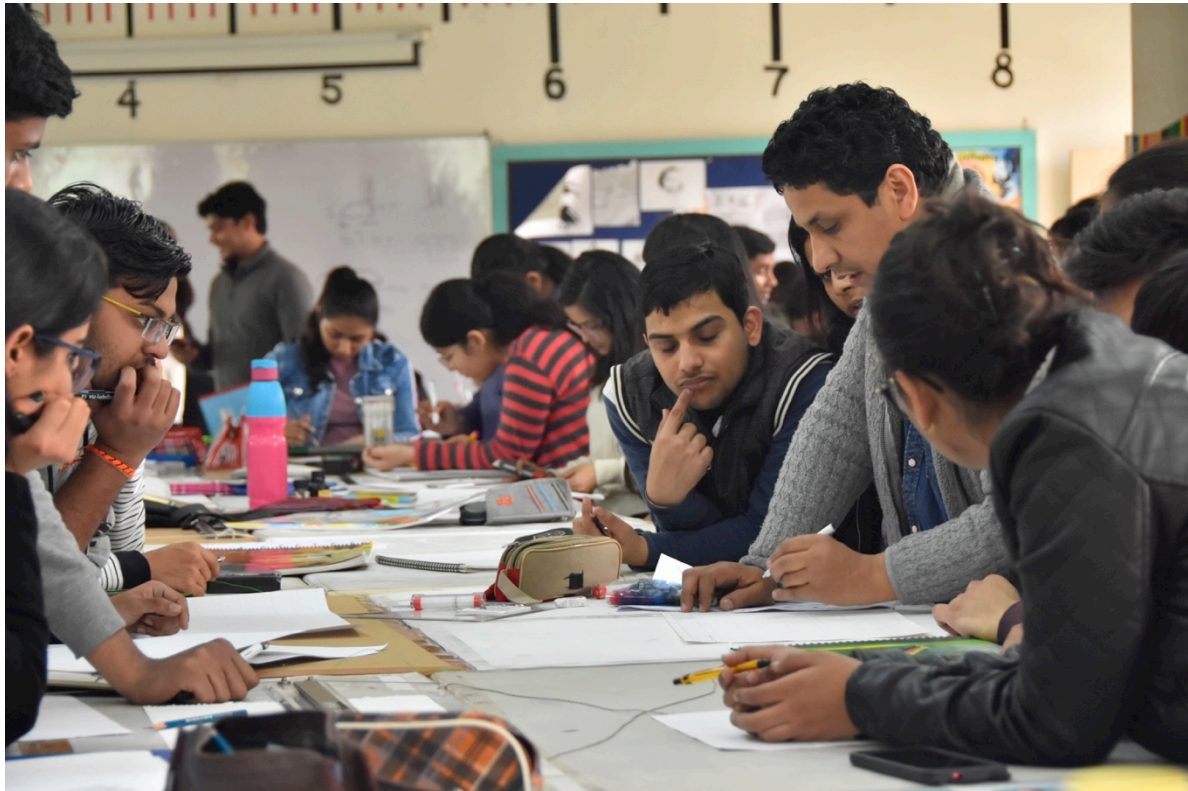
Resource person explaining the exercise to the students in groups.

Skill development program was organized for the first year students to improvise their writing skills through Calligraphy. During the session the students were assigned a few exercises that they were asked to do individually under the supervision of the resource person.