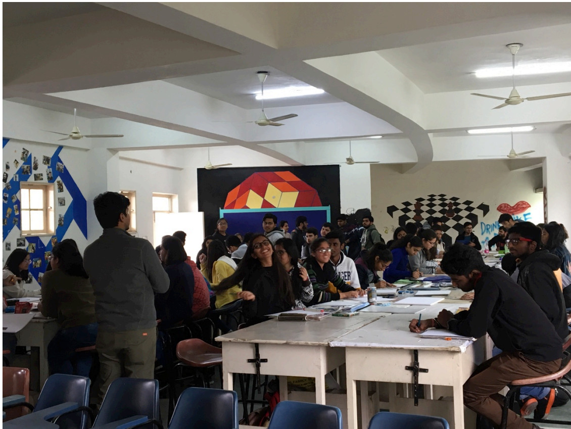
Students trying their hands at Calligraphy.