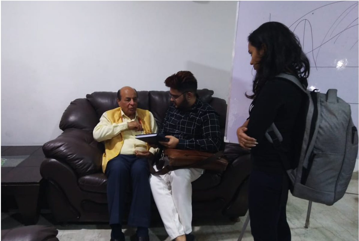
Fourth year students sharing their work for his valuable inputs.