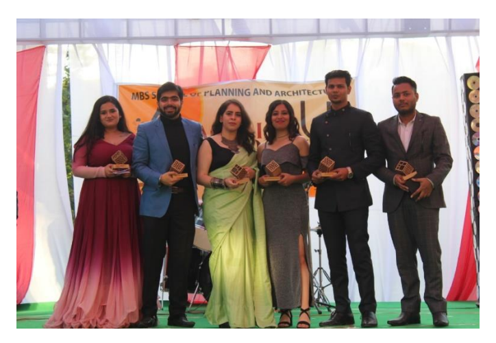
Graduating batch with the titles.

The graduating batch were given the titles and later the students played a movie on the student-life of MBS SPA acted & directed by their juniors. The movie was short, funny and represented the witty part of being in the college and enjoying it in every moment.