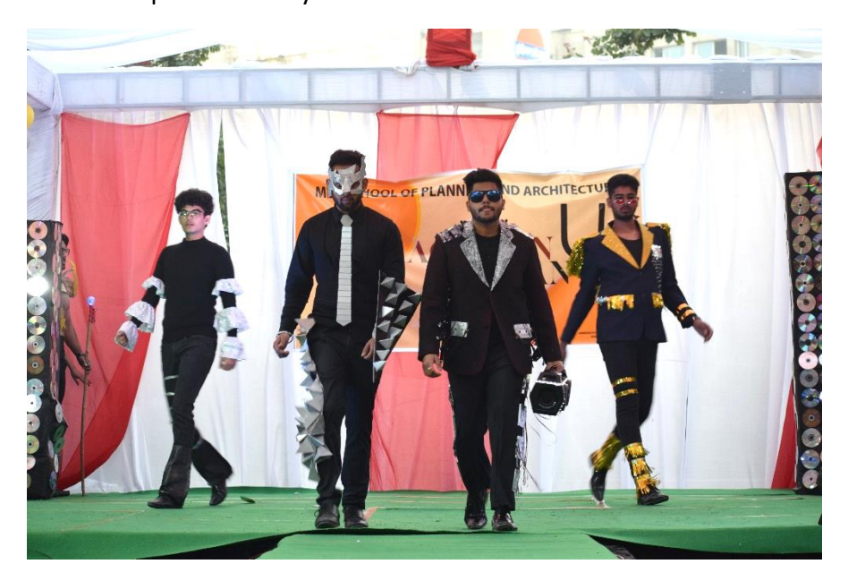
The students exhibited their creativity in the fashion show using bizarre materials to create unconventional dresses and presented them beaming with confidence.

The next in the event was fashion-show showcasing the creative side of the students. Using the unexpected materials and their creativity the students exuded the confidence on stage during the fashion show and impressed everyone.