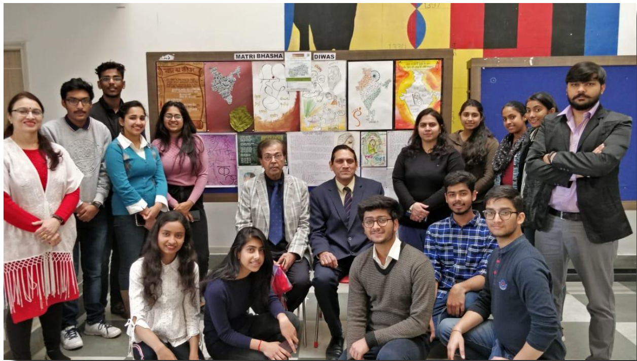
Picture 2- Entries with Participants, Coordinators and Jury