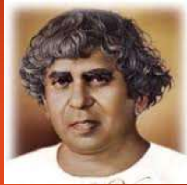
SADHU T.L VASWANI

If you want to enter the kingdom of heaven- be like a child.