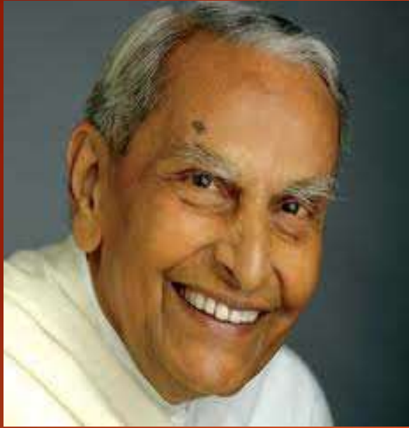
DADA J.P. VASWANI