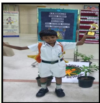
Interschool competition Fantasy World in space III Prize