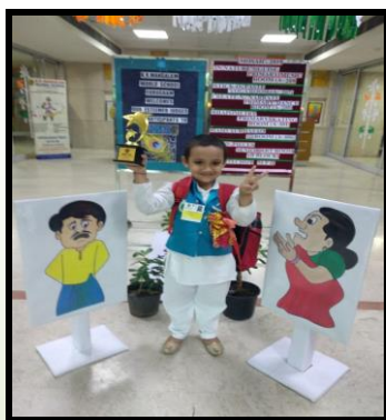
Interschool Competition Hasya Kavita II Prize