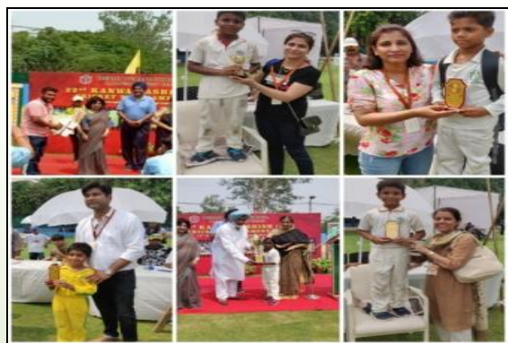
Kanwar Ashish Cricket Tournament II Runner up