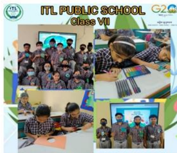
Activity - Eco Buddy - The Badge Bearers