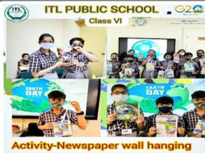
Activity-Newspaper wall hanging