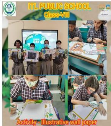
Activity - Illustrative wall paper