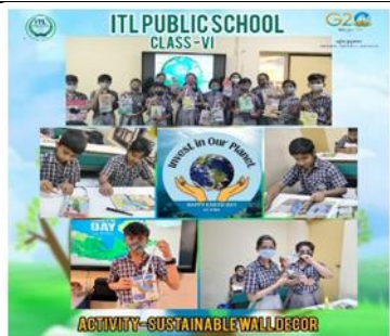
ACTIVITY-SUSTAINABLE WALL DECOR